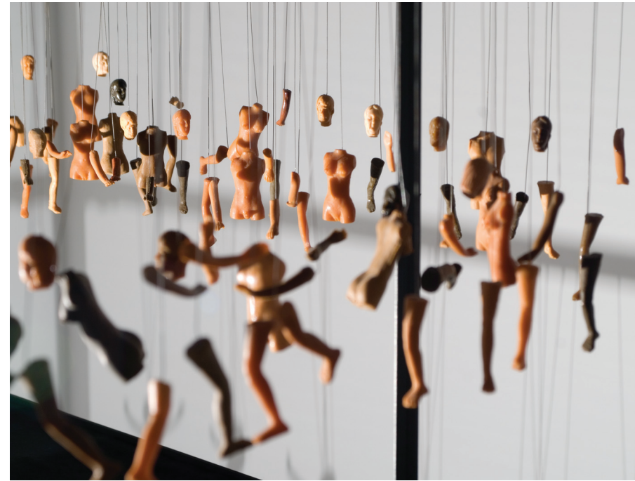
Silicon rubber body parts within Structure of Shadow installation.