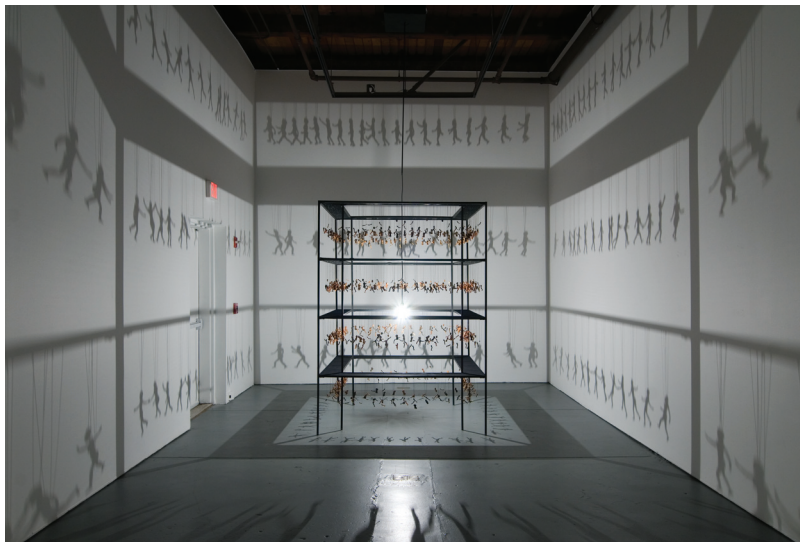
Installation view at Real Art Ways of Structure of Shadow (silicon rubber, wire, steel, light bulb, motor, sensor, 60"x90"x60", 2009).

In reality, a pink female leg dangles next to a tawny male torso, which hangs beside a dark brown female head, and so