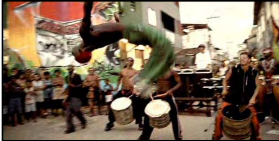
© Favela Rising , from www.favelarising.org

This resource packet includes the curriculum for a two-hour film screening and a 5-lesson unit for high school level students on understanding the power of community to address local problems.